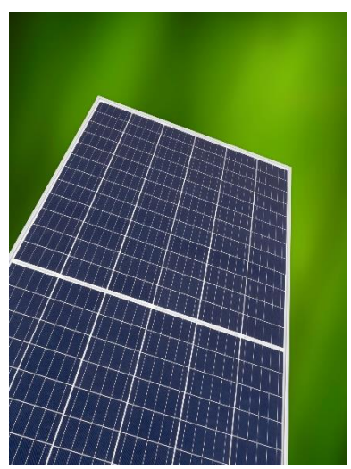
REC TwinPeak 2 REC TwinPeak 2S 72