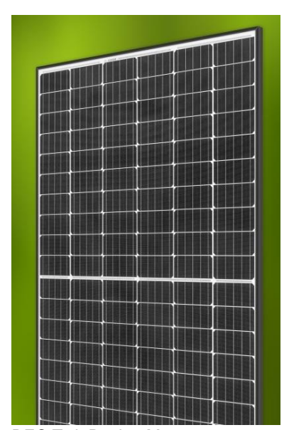
REC TwinPeak 2 Mono REC TwinPeak 2S Mono 72